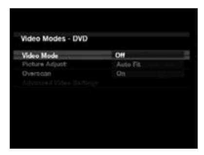
Figure 33 – Video Modes Menu

NOTE : The settings in the Video Modes menu affect each source independently.